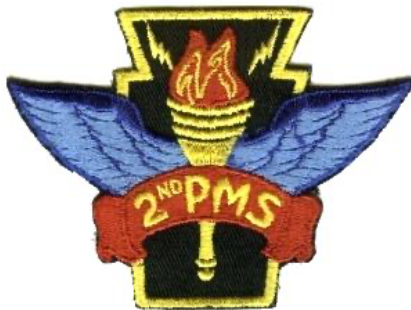
2 Periodic Maintenance Squadron emblem