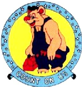
2 Organizational Maintenance Squadron emblem